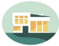
ሪል ኢስቴት (በመኖሪያ ቤት ውስጥ ያለን ድርሻ ጫምር)