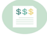
የገንዘብ ሂሳብ (አካውንት)