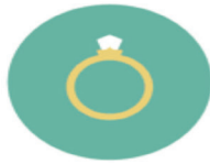
ዋጋ ያላቸውን ንብረቶች